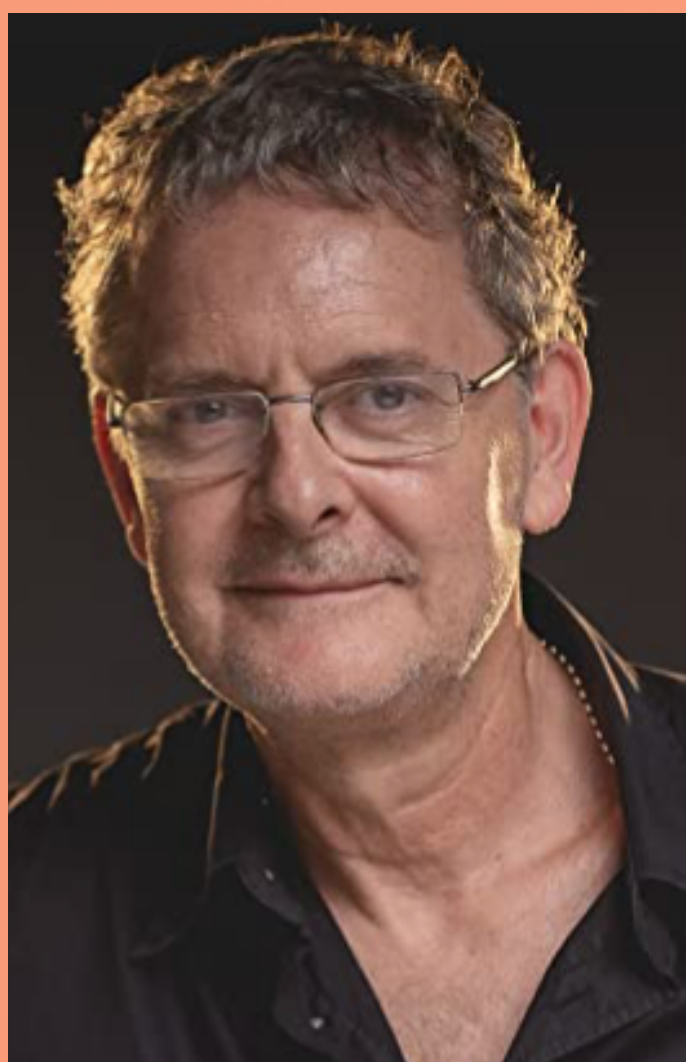
PEP ARMENGOL SPAIN